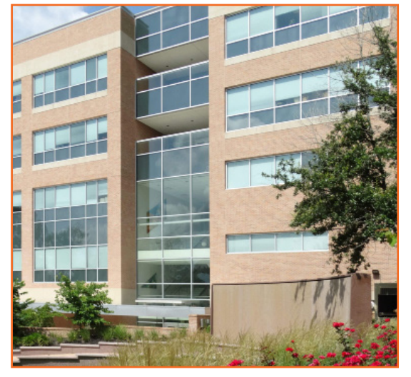
College of Humanities and Social Sciences Building